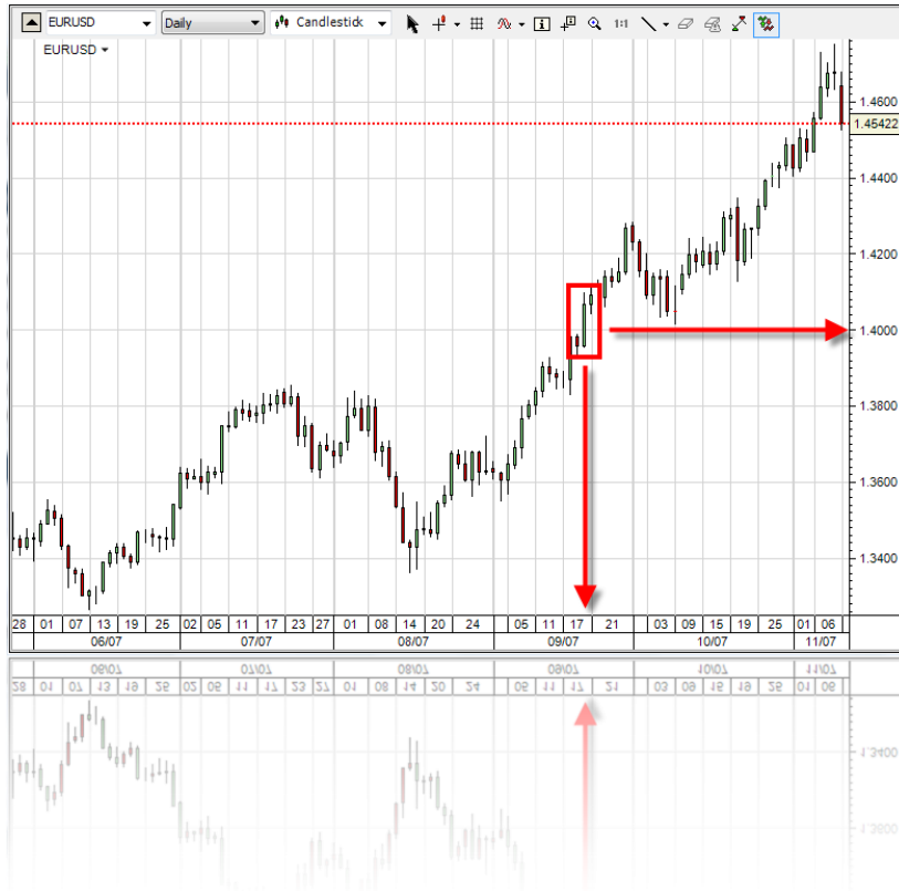
CHART TIME FRAMES

Saxo Bank forex charts give you the ability to analyze the price movement of your favorite currency pair anywhere from a minute-by-minute basis to a month-by-month basis. You have the flexibility to choose which time frame is best for you.