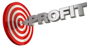
And profit targets