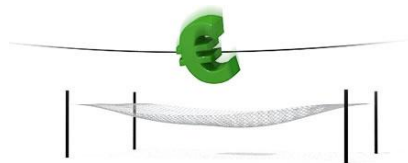
Stop loss orders

Courtney Capital Private Wealth recognises the need that clients have to interact with their broker. Consequently we would like to invite you to another one of our lunchtime meetings. We will have an informal introduction to one of our trading platforms, specifically showing how to enter Buy & Sell orders; as well as how to load stop loss levels & profit targets in advance. This can be used by both long-term investors and short-term traders.